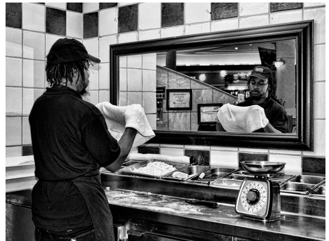
Monochrome Print by Veronica Beaudry