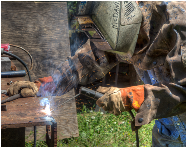
Color Print by Charles Gattis